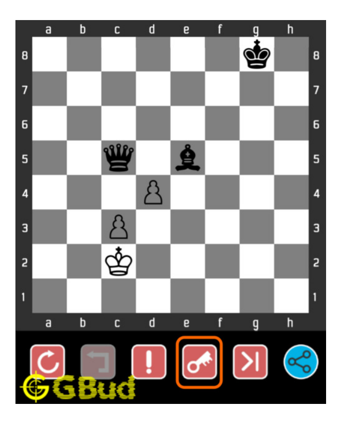
Figure 1.3: Click the solution button to view solutions @ https://gbud.in/g99lz41