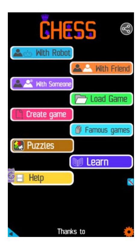
Figure 1.7: Play chess online for free. Solve puzzles and play with friends

Play chess for free at https://gbud.in/chs